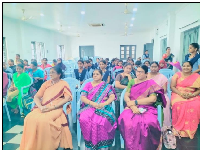
Audience to the Lecture by Resource person