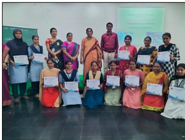
Students with the Certificates